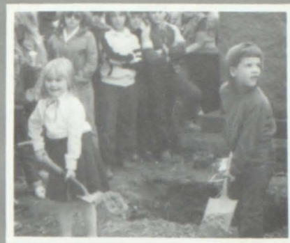
BURYING OF THE TIME CAPSULE