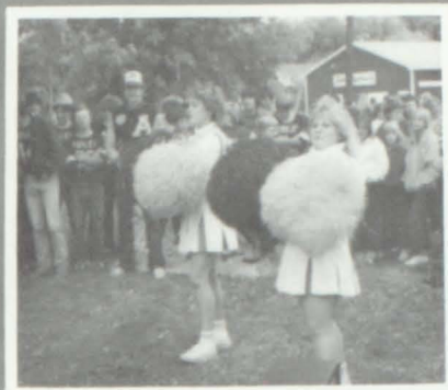
CHEERLEARDERS AT PEP ASSEMBLY