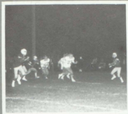
FOOTBALL TEAM IN ACTION